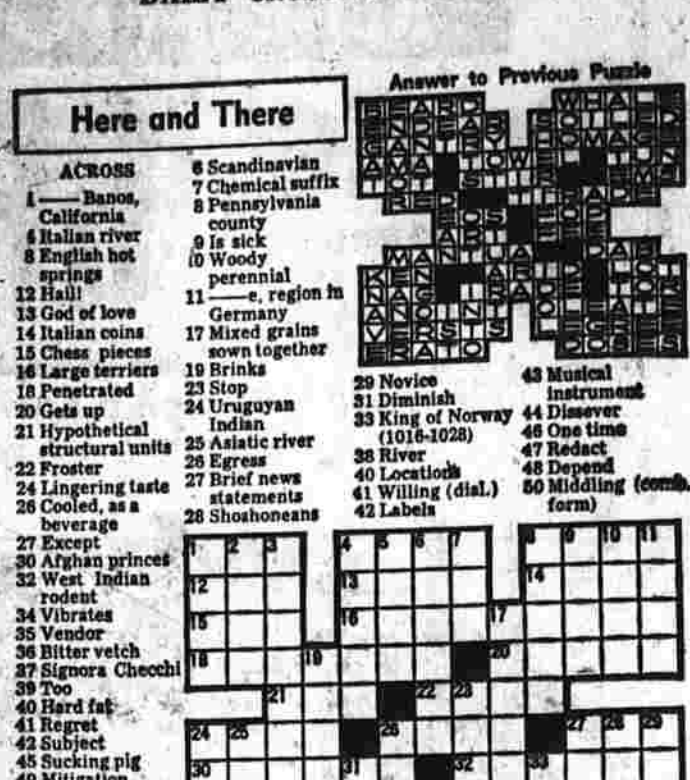
DAILY CROSSWORD PUZZLE